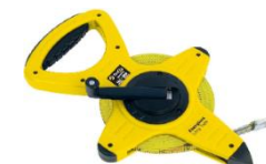
165-FT Tape Measure