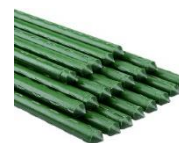
1 Dozen 3-FT Garden Stakes